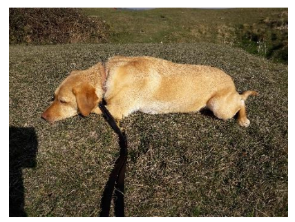
Daisy enjoying a well-deserved rest!

The Plant and Craft sale (see page xx) raised over £750 which is fantastic but the Gold Star must go to Daisy the